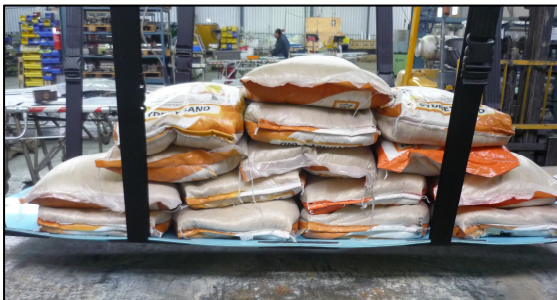
300kg handle load test

DHS Emergency 321 Milperra Rd Milperra, NSW Ph 612 8724 6833 Fax 612 9774 2922 www.dhsemergency.com